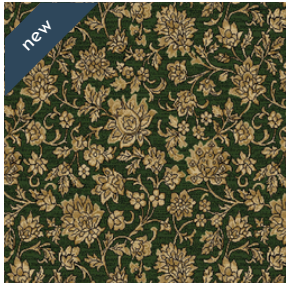
Kyber Dark Green