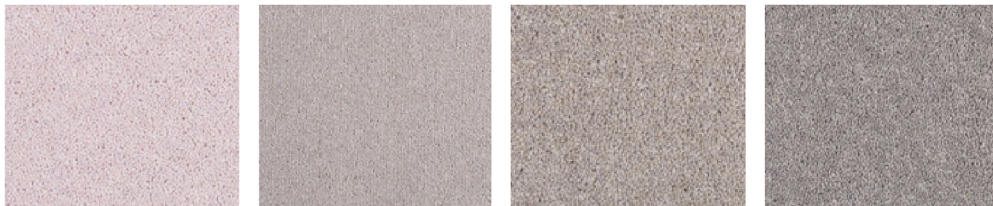
Mother of Pearl