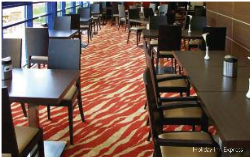
Holiday Inn Express