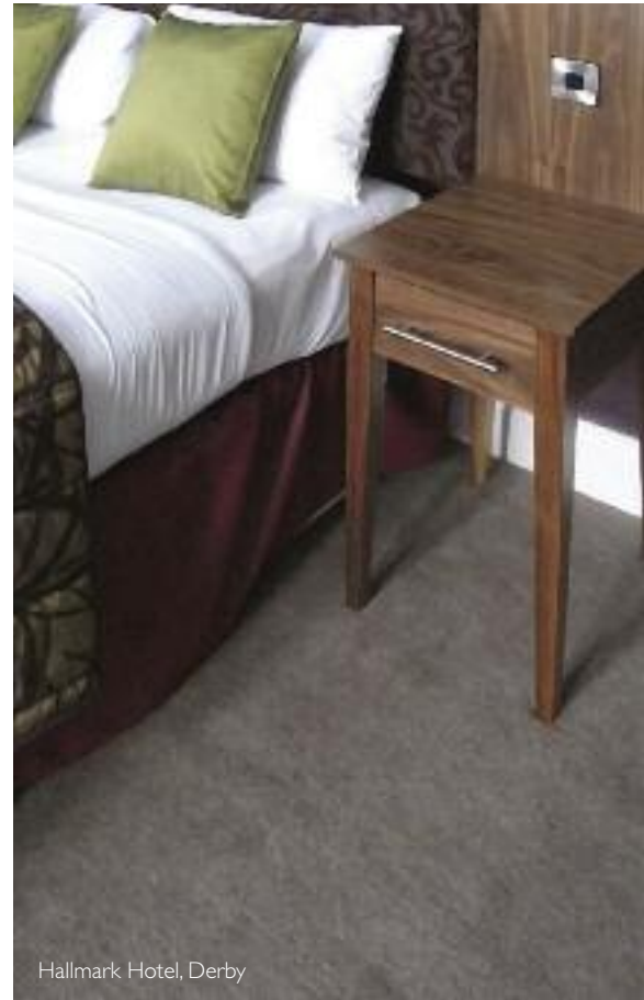
Hallmark Hotel, Derby