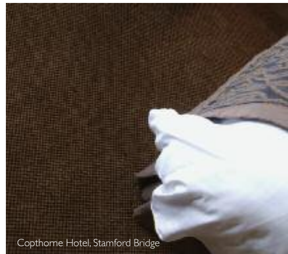
Cophorne Hotel, Stamford Bridge