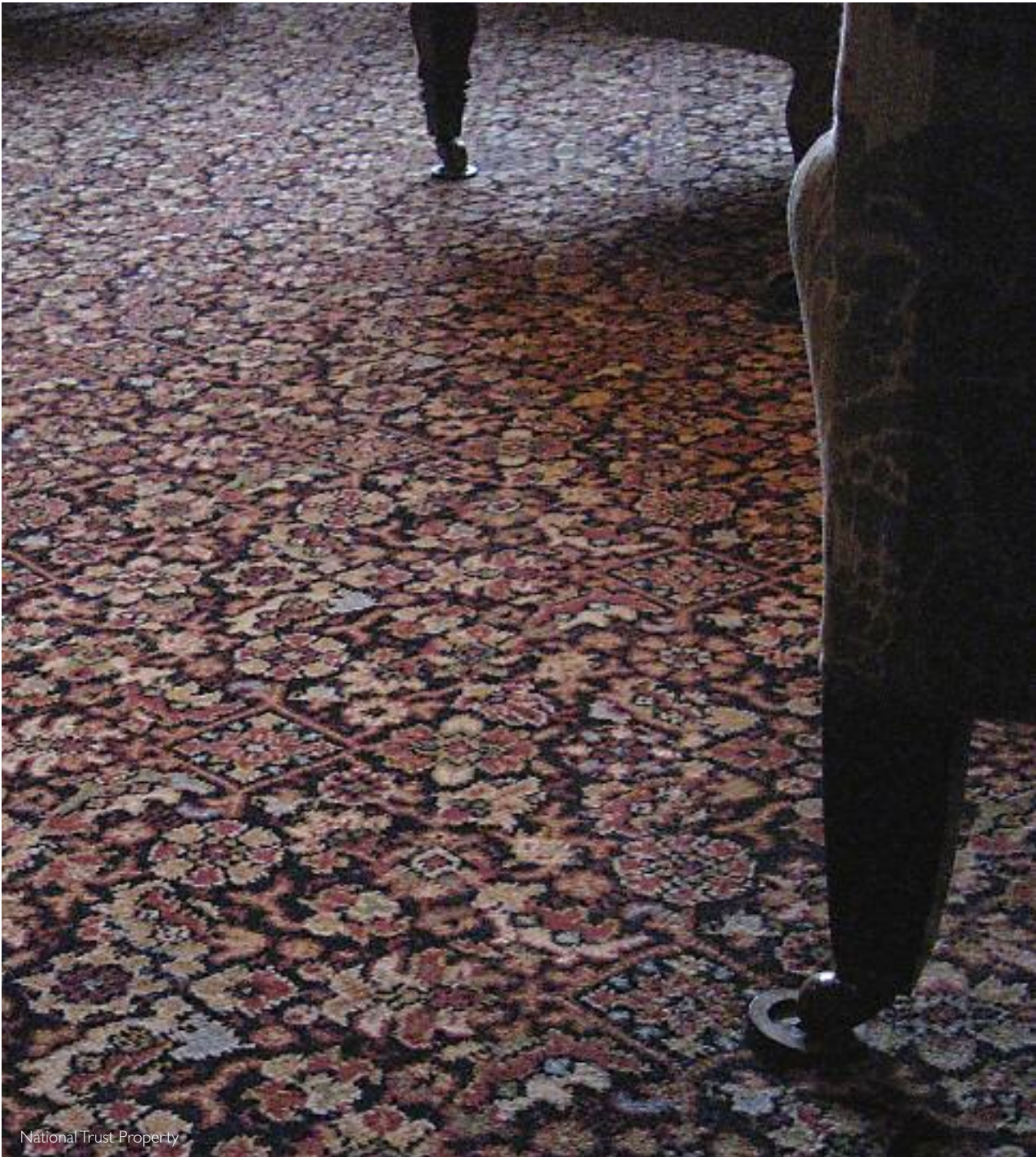
National Trust Property