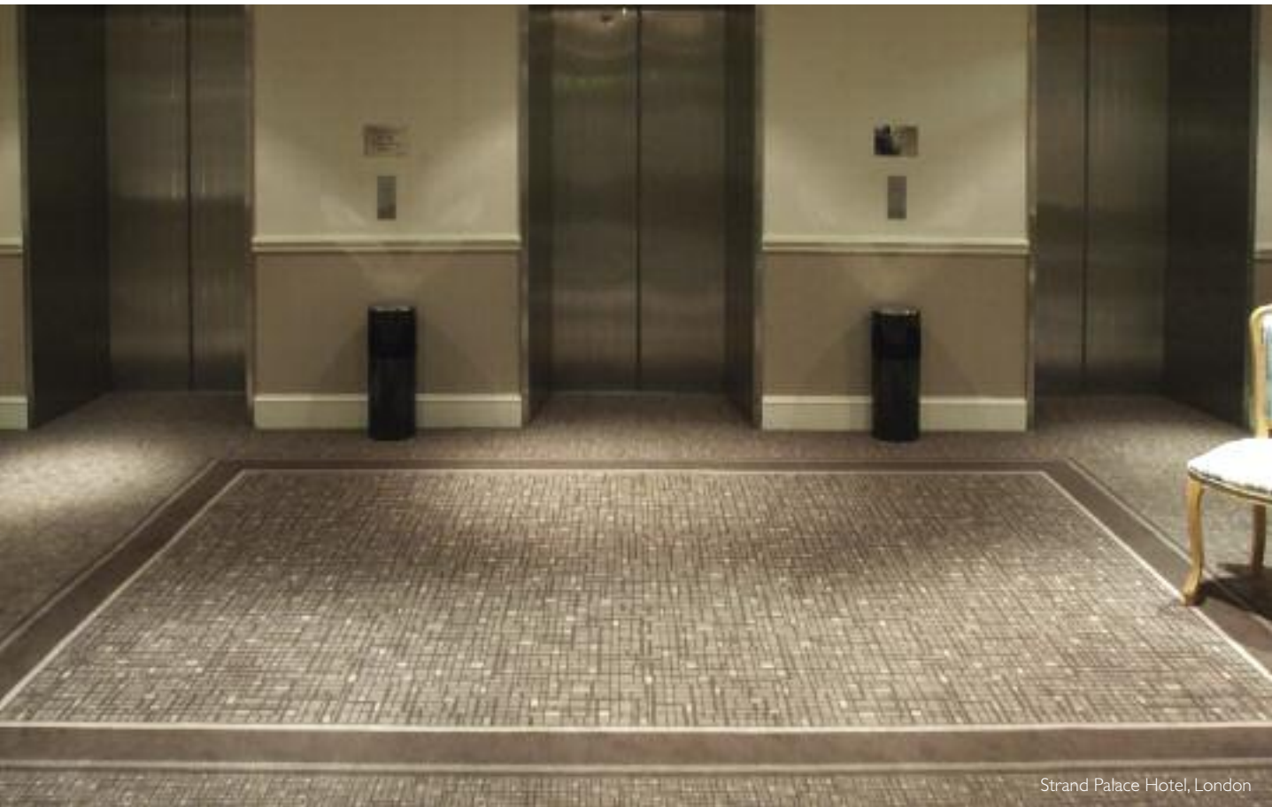
Strand Palace Hotel, London